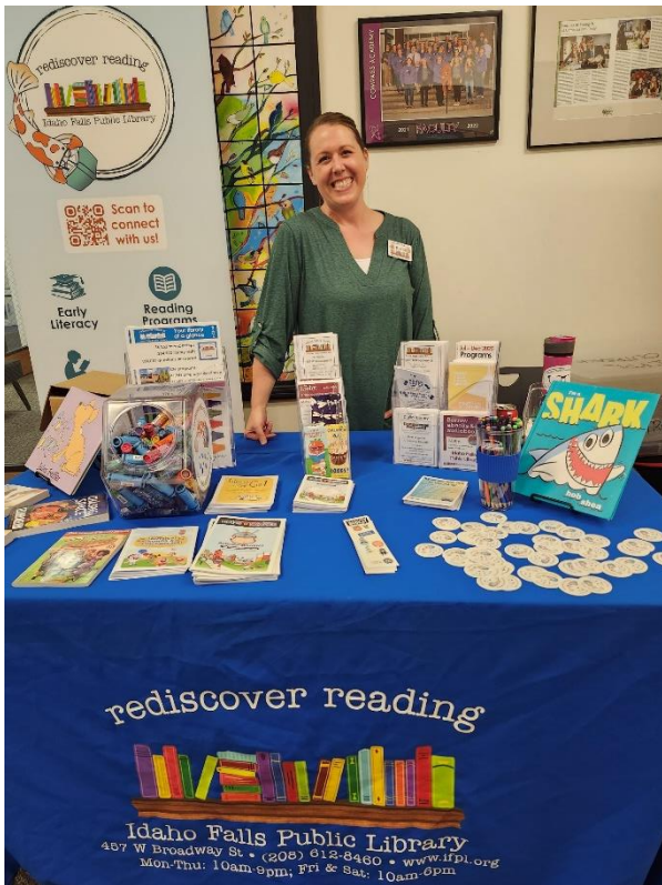
Figure 122 / September 30, 2025 - Idaho PTA More Social Less Media