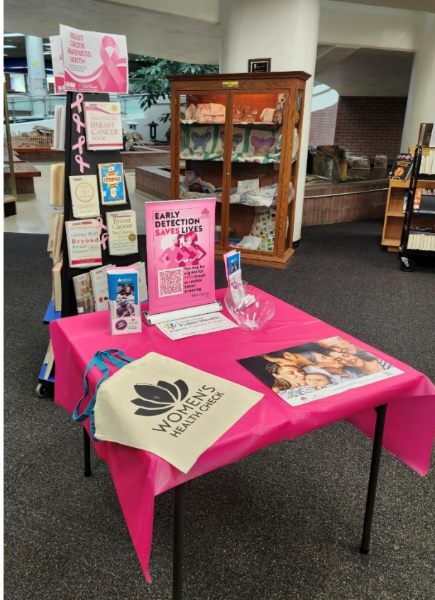
Figure 11 / October 20, 2025 - Eastern Idaho Public Health Breast Cancer Awareness Month display