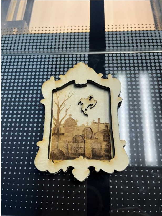
Figure 9/ October 24 - Teen INC, Laser cut ghostly portraits