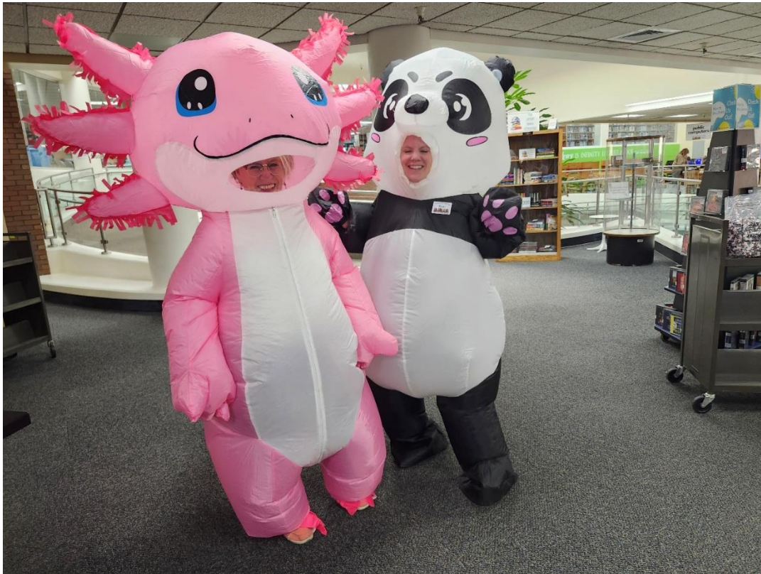
Figure 7 / October 29, 2025 - Halloween Parade (Liza and Keri)