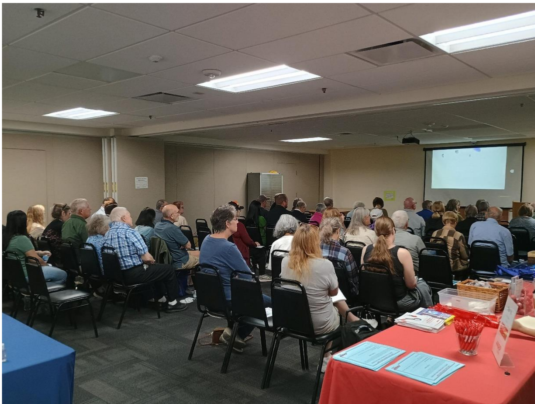
Figure 1 / September 24, 2025 – Senior Fraud and Financial Exploitation Prevention Roadshow

Photos from recent programs, pages 2 – 5