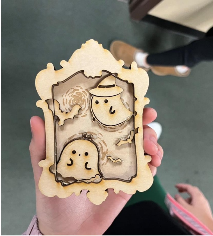
Figure 8 / October 24 - Teen INC, Laser cut ghostly portraits