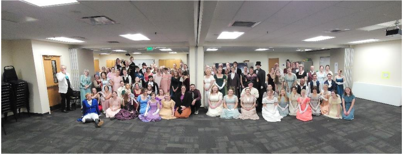
Figure 6 / October 7, 2025 - Austen Ball participants