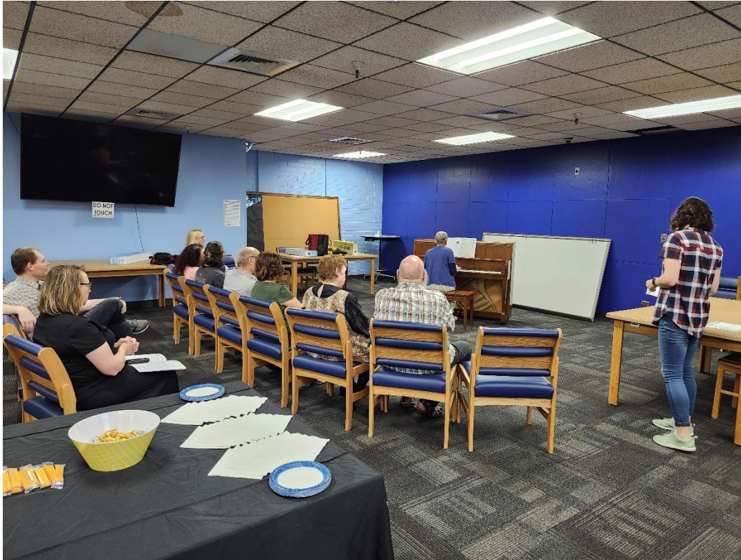
Figure 2 / September 25, 2025 - Never Too Late Recital