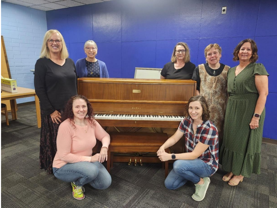
Figure 3 / September 25, 2025 - Never Too Late students and instructor