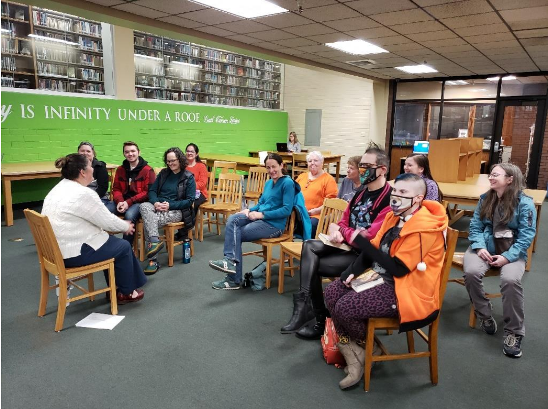
Figure 7 / Banned Books Club, October 3, 2023