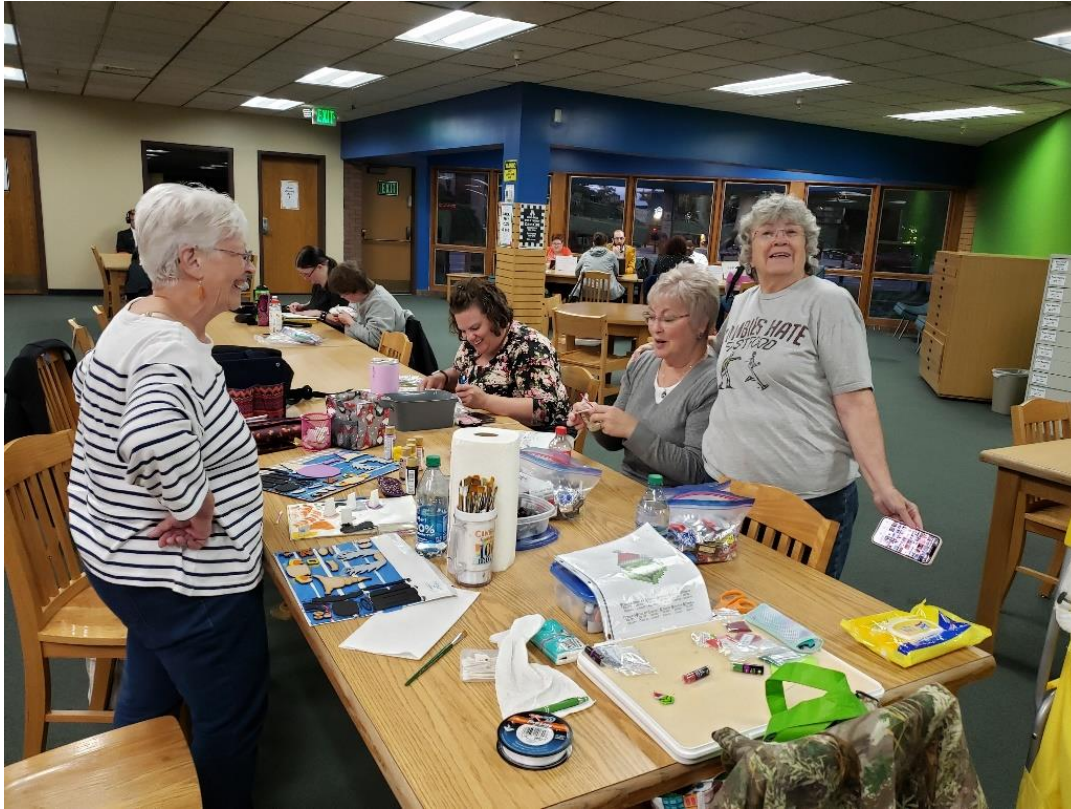
Figure 12 / Crazy Crafters, October 3, 2023