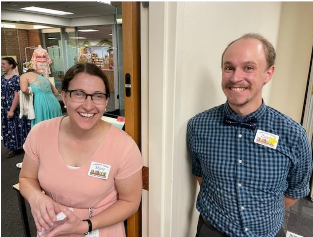
Figure 2 / Staff at the Austen Ball, October 10, 2023