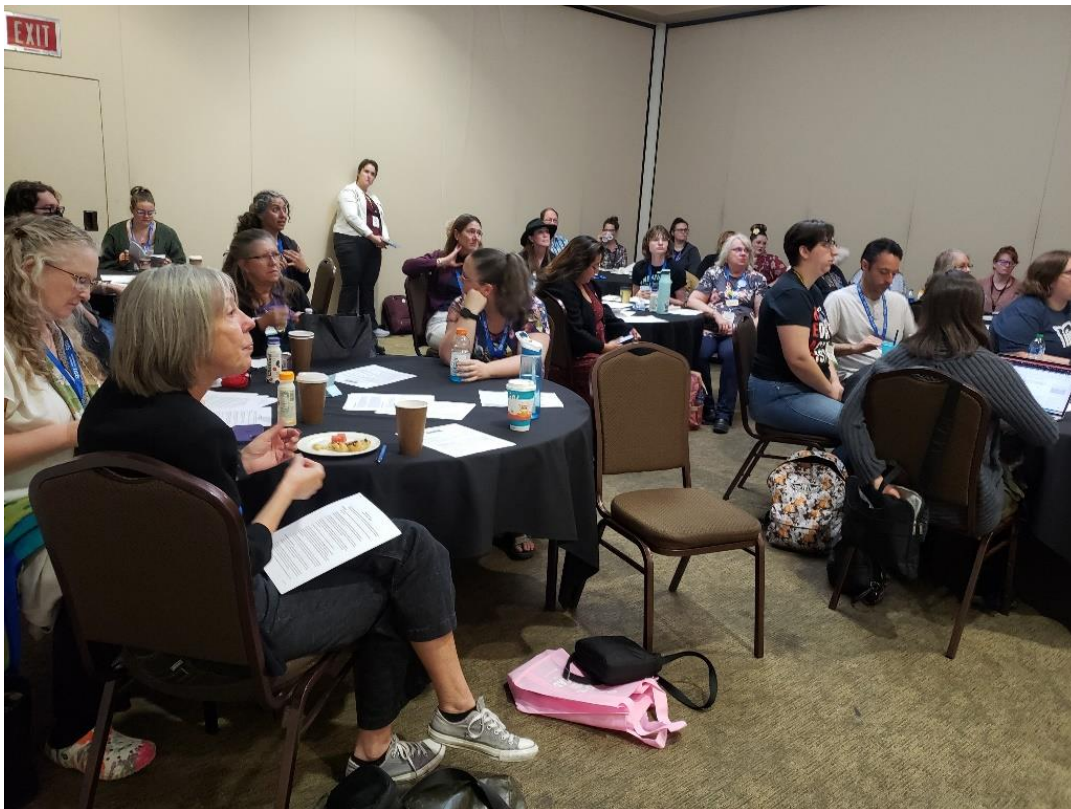
Figure 155 / Idaho Library Association Conference, October 6, 2023