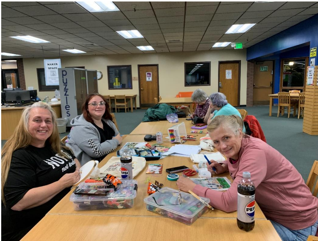
Figure 13 / Crazy Crafters, October 24, 2023