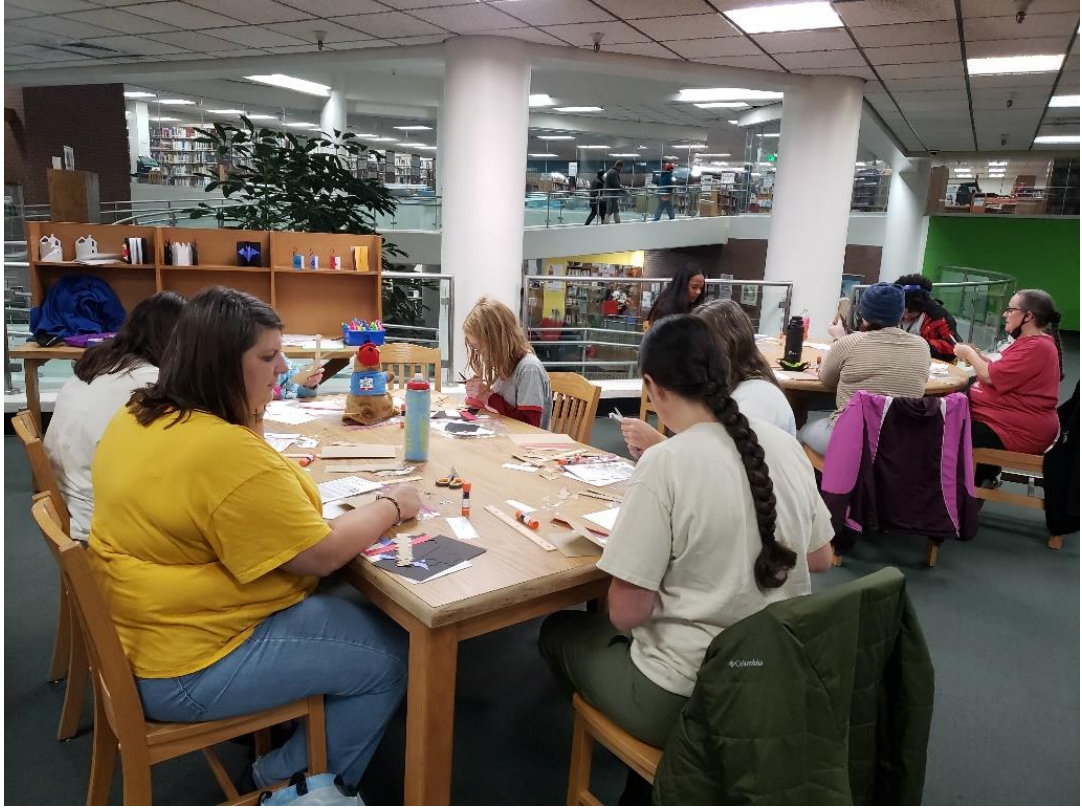
Figure 9 / Bookmaking, October 25, 2023