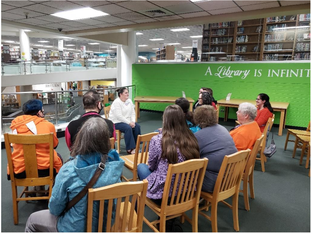
Figure 8 / Banned Books Club, October 3, 2023