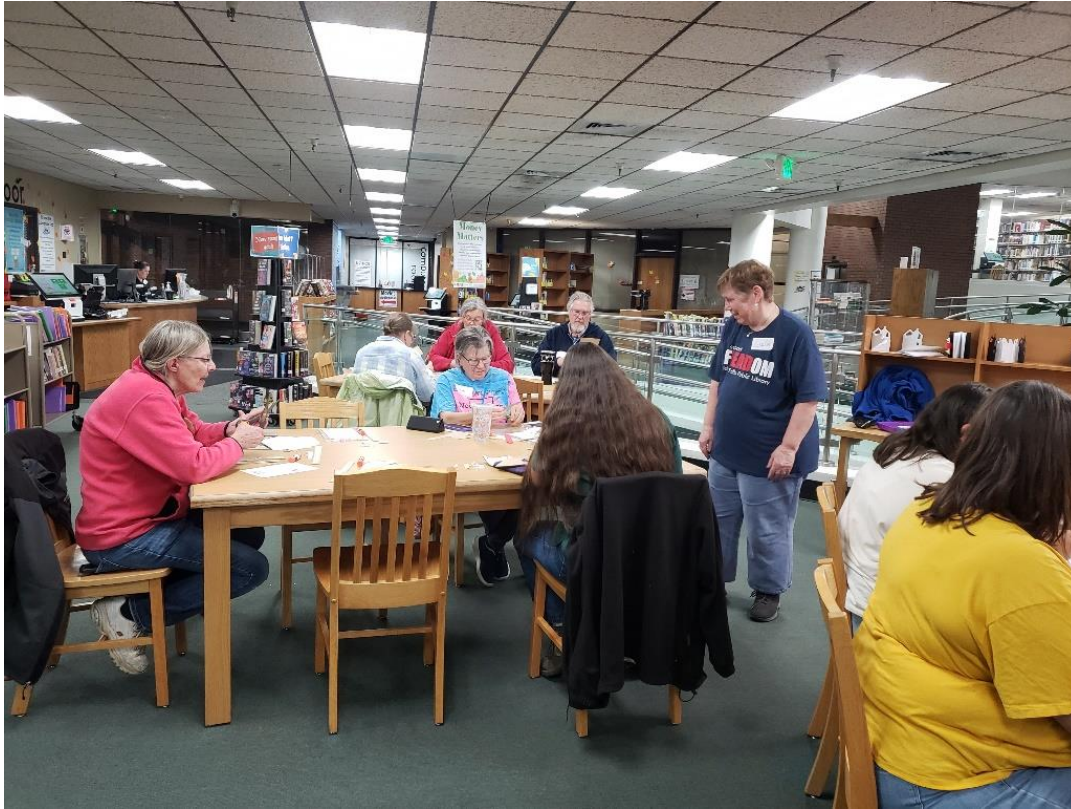
Figure 10 / Bookmaking, October 25, 2023