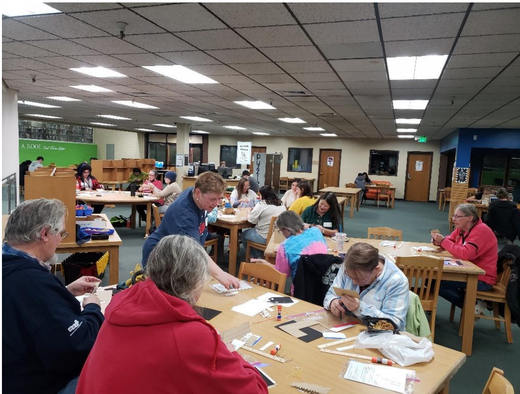
Figure 11 / Bookmaking, October 25, 2023