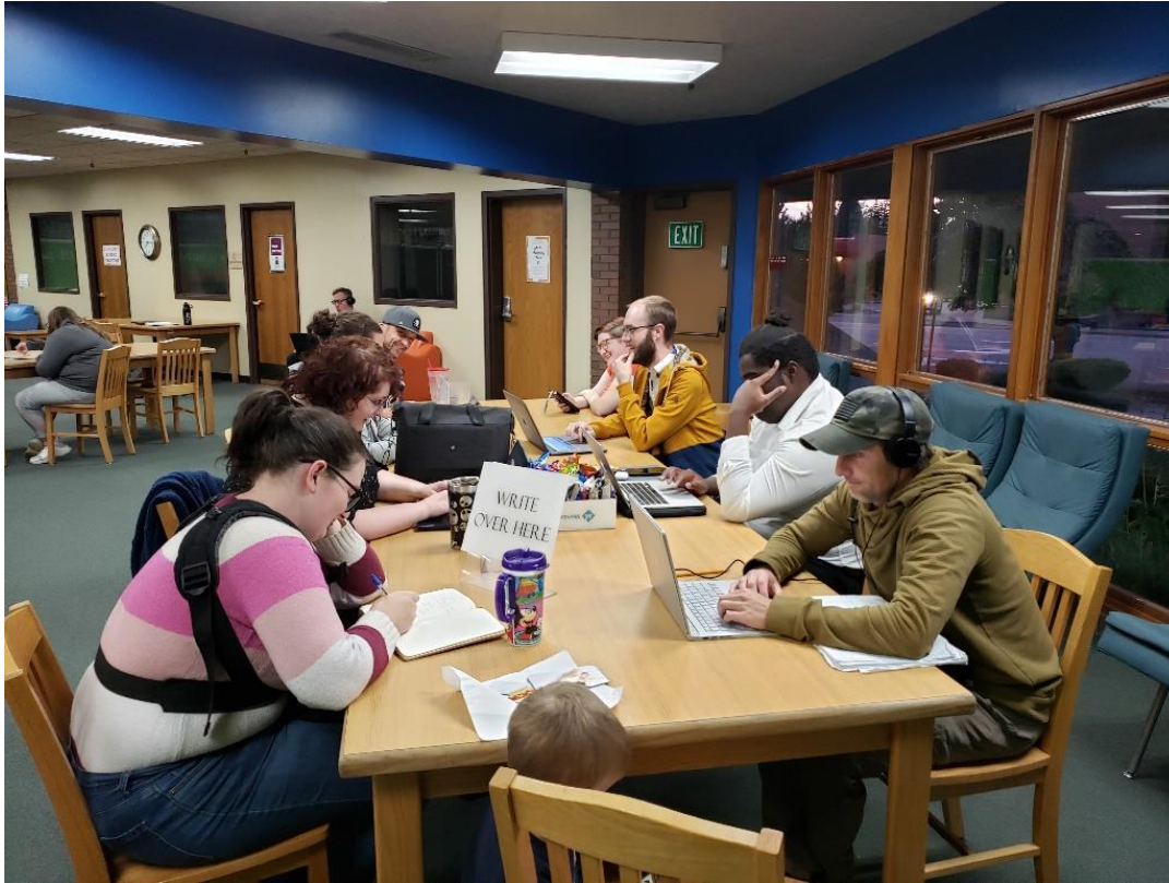
Figure 14 / Write Over Here, October 3, 2023