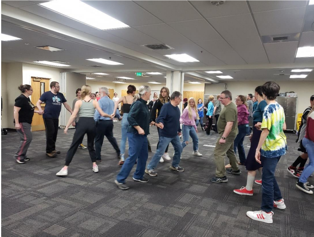
Figure 1 / Austen Ball practice, October 3, 2023