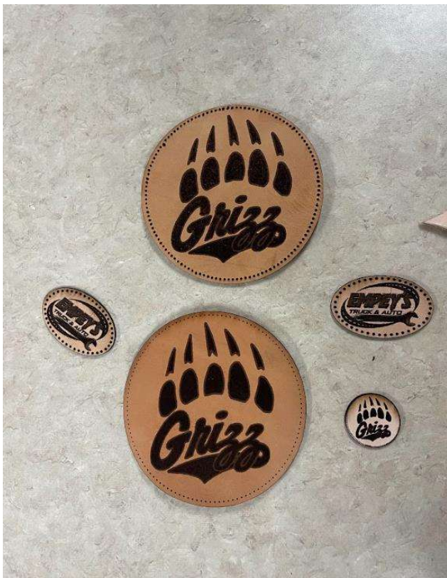
Figure 8 / Recent Makerspace projects