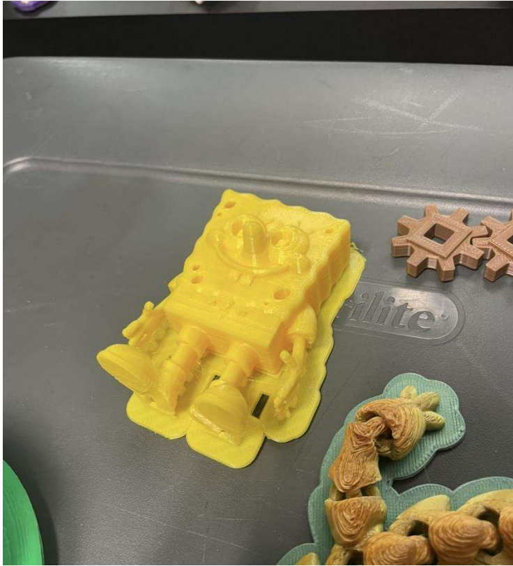
Figure 7 / Recent Makerspace projects