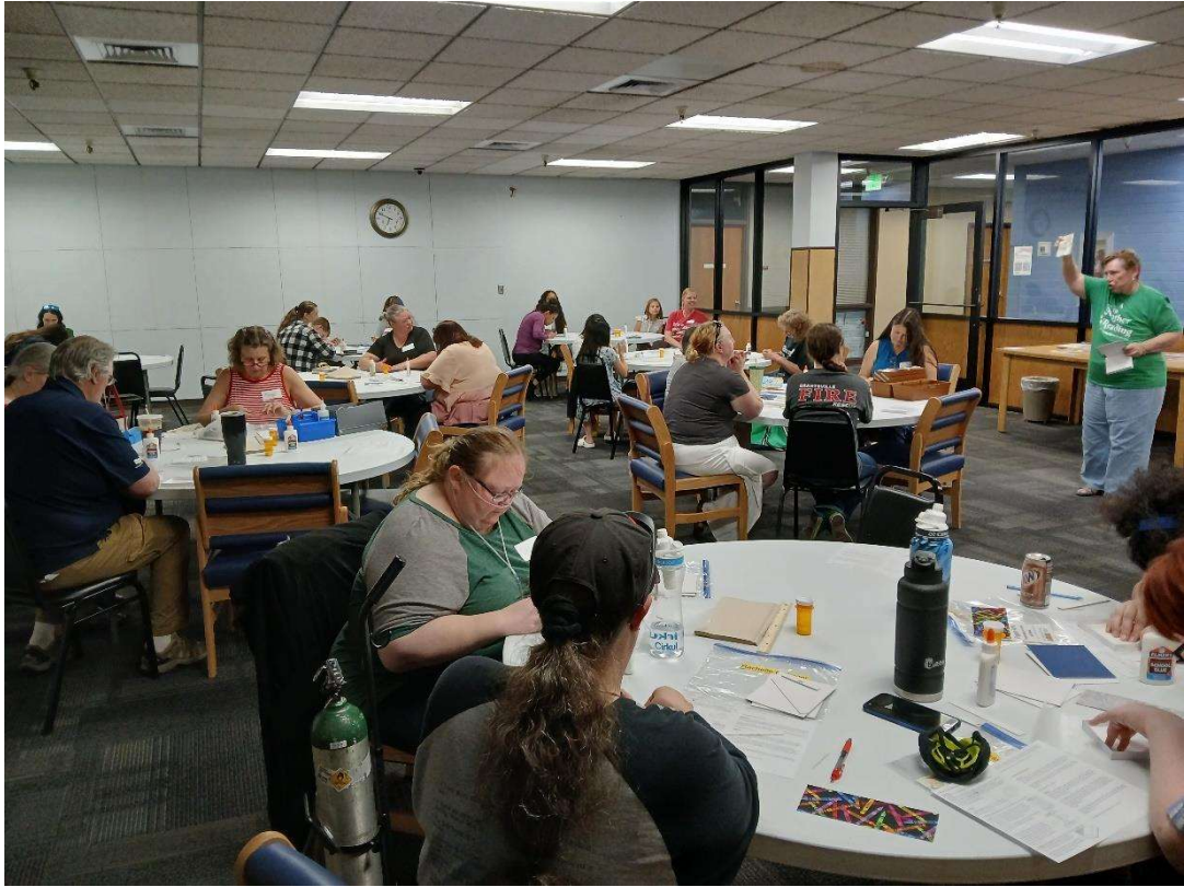
Figure 2 / Paper Arts, June 12, 2024