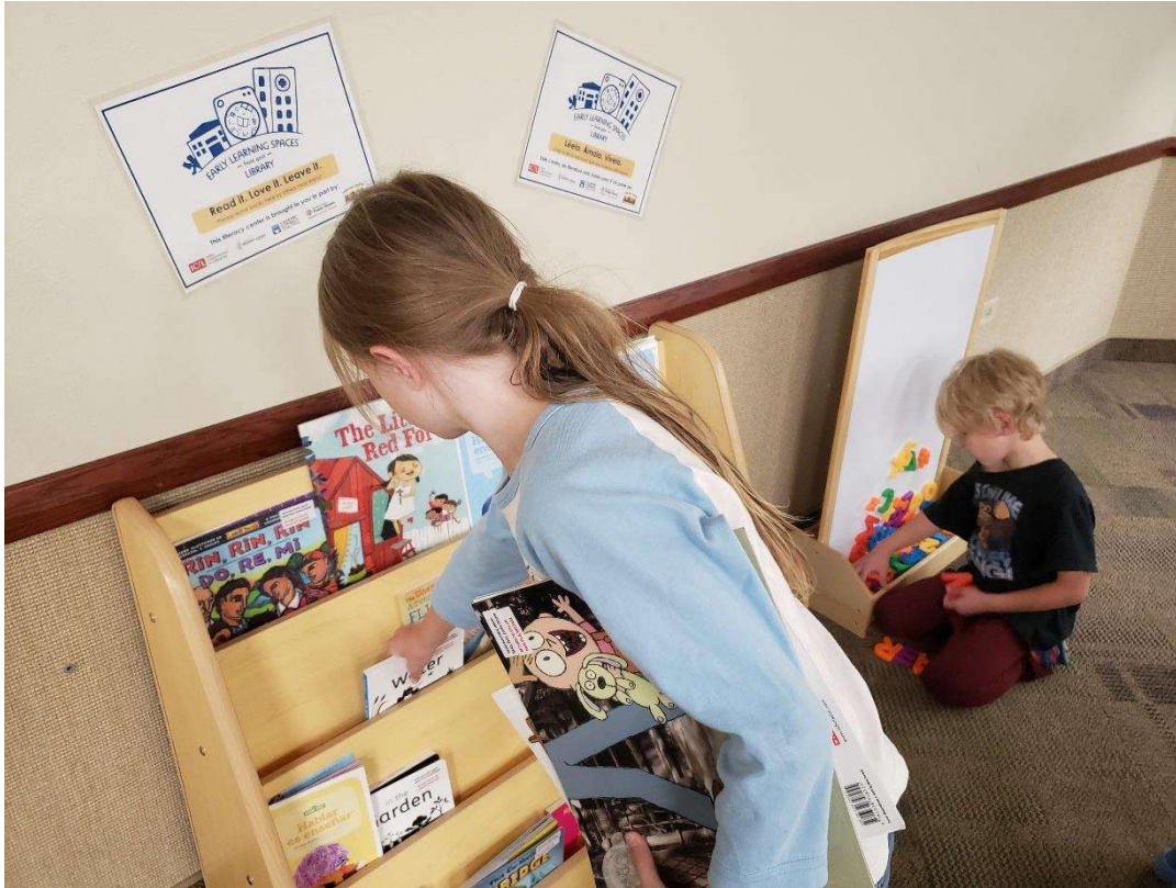
Figure 10 / Children using IFPL's Early Learning Center at Eastern Idaho Public Health