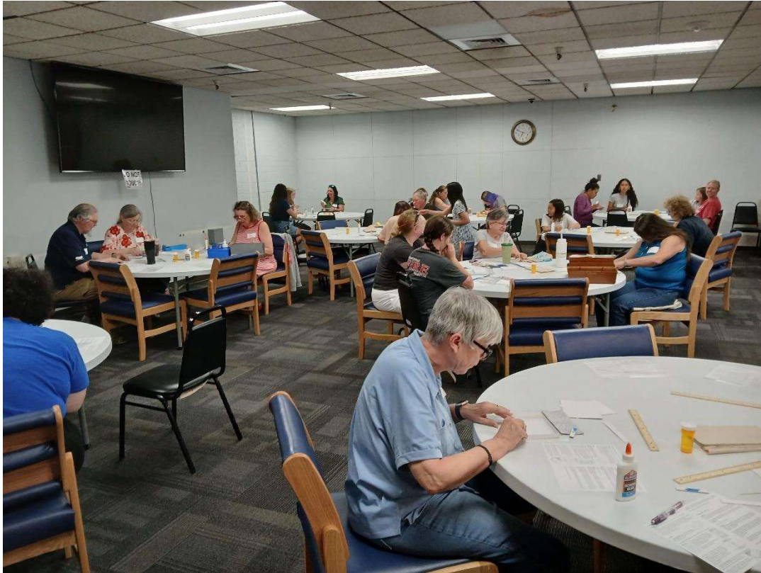
Figure 1 / Paper Arts, June 12, 2024

*** Photos are 4.2x5.6 with captions that include program and date