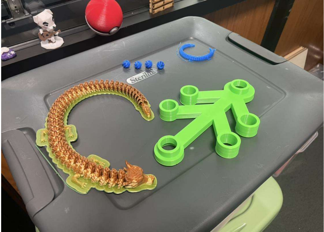
Figure 6 / Recent Makerspace projects