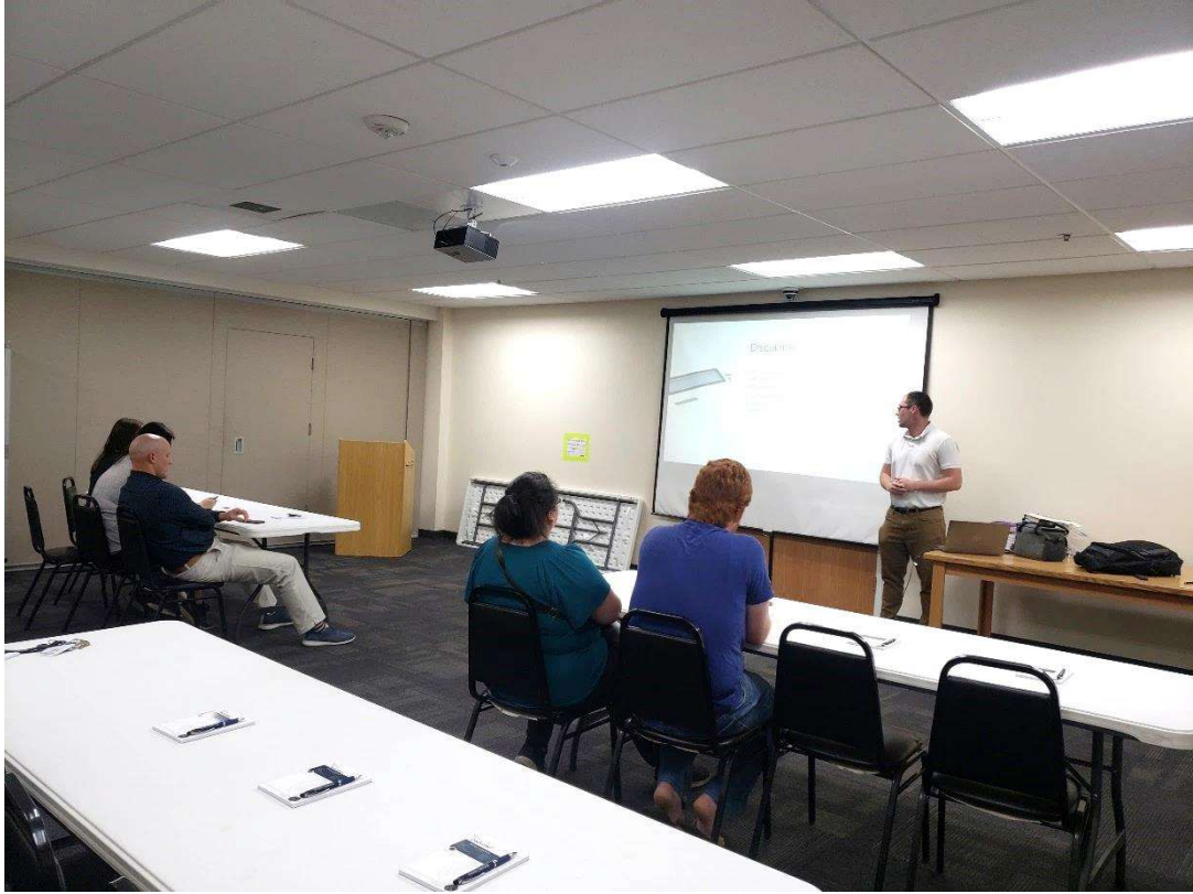
Figure 3 / Money Matters, August 14, 2024