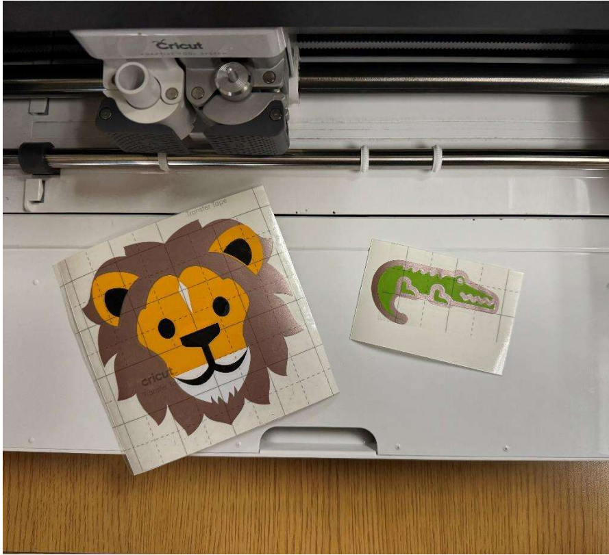
Figure 4 / Teen INC project - Cricut cut vinyl stickers, July 17, 2024