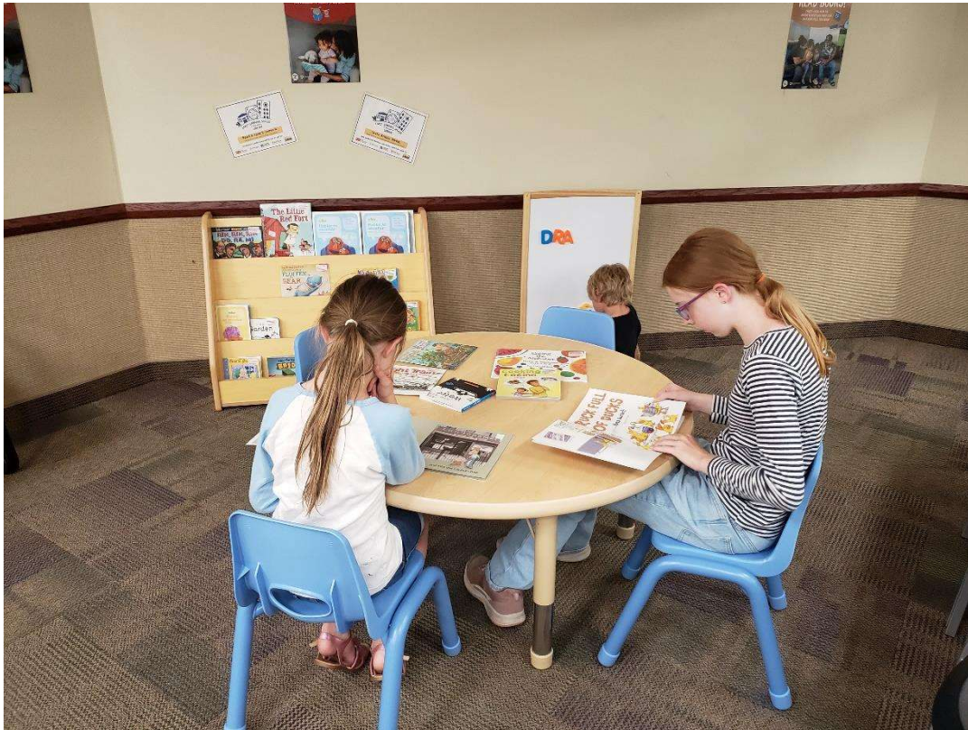
Figure 9 / Children using IFPL's Early Learning Center at Eastern Idaho Public Health