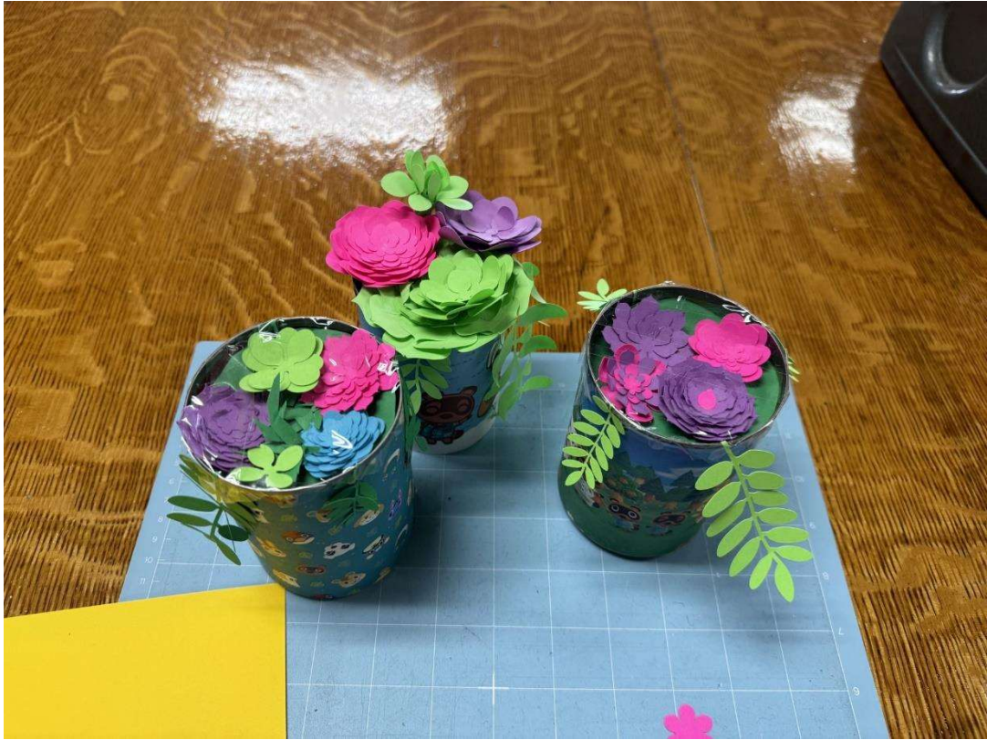
Figure 5 / Teen INC project - Animal Crossing succulent cants, August 14, 2024