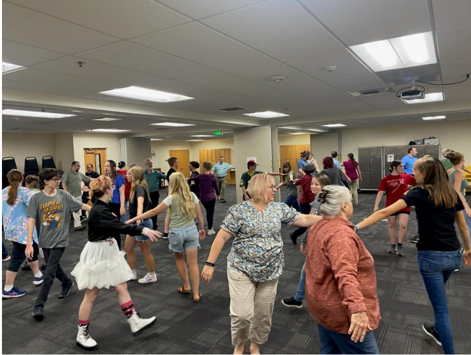
Figure 2 / Jane Austen Ball Practice - English Country Line Dance, September 19, 2023