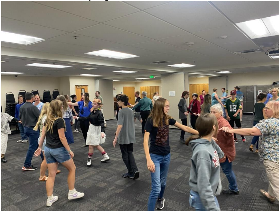
Figure 1 / Jane Austen Ball Practice - English Country Line Dance, September 19, 2023