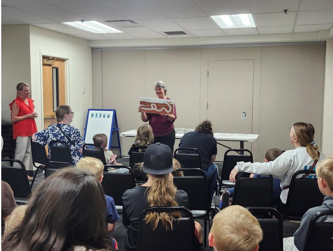
Figure 13 / August 12, 2025 - Paws & Pages