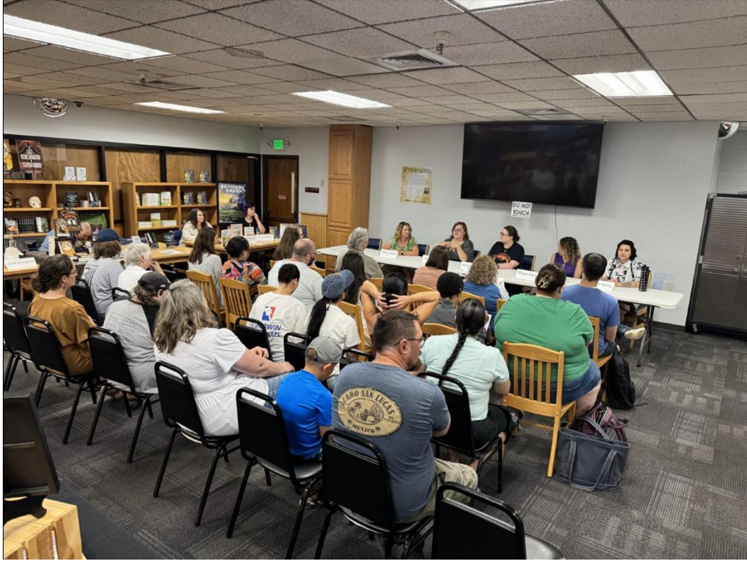
Figure 5 / June 14, 2025 - Authorpalooza