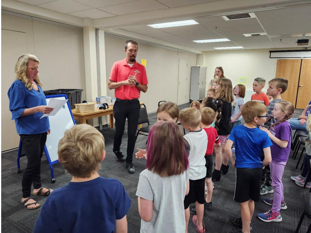
Figure 2 / June 10, 2025 - Paws & Pages