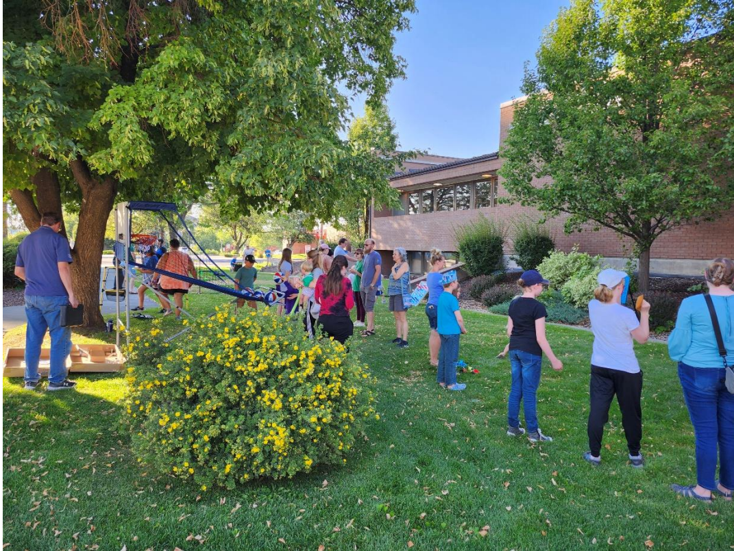
Figure 12 / August 11, 2025 - Summer Reading Party