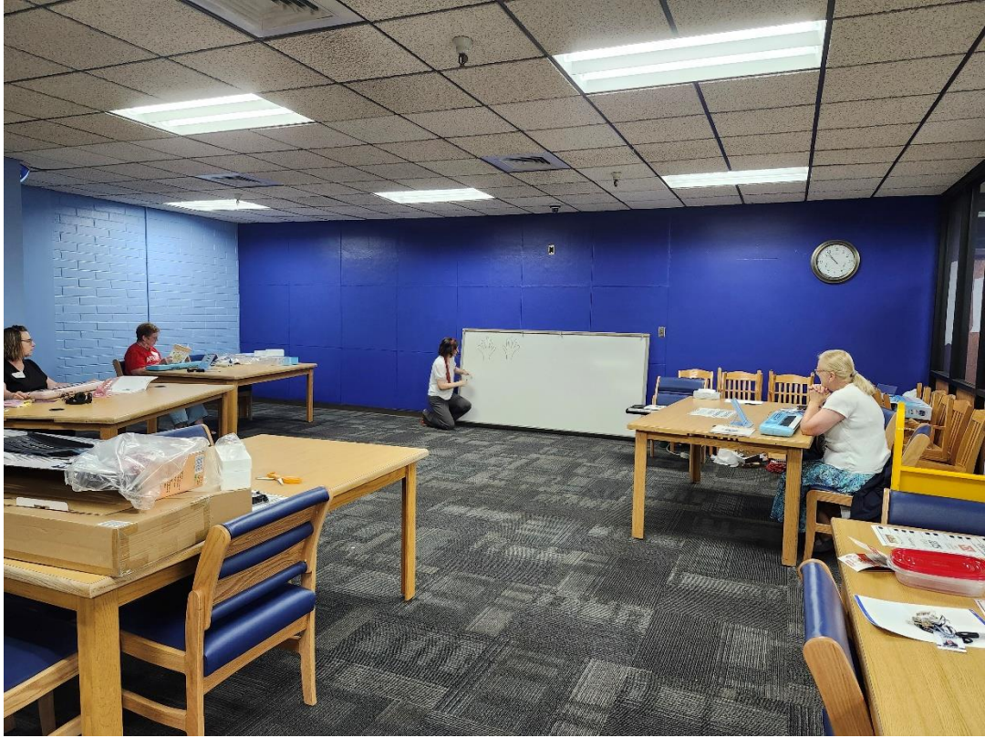
Figure 10 / August 7, 2025 - Never Too Late