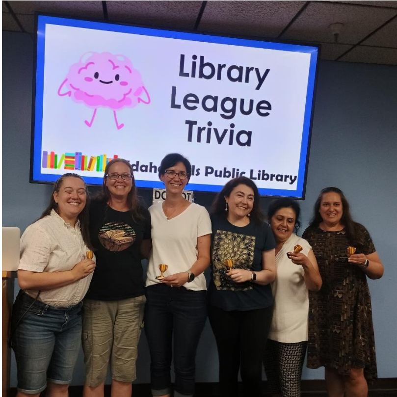
Figure 9 / August 6, 2025 - Library League Trivia winners with custom 3D printed trophies from Makerspace