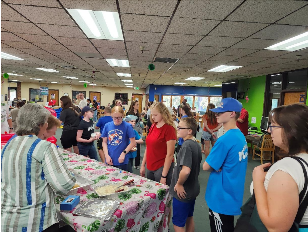
Figure 11 / August 11, 2025 - Summer Reading Party