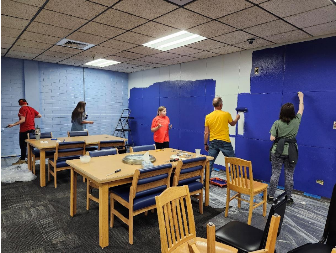
Figure 15 / June 19, 2025: Volunteers painting the 2nd Floor Program Room

Photos from recent community engagement events