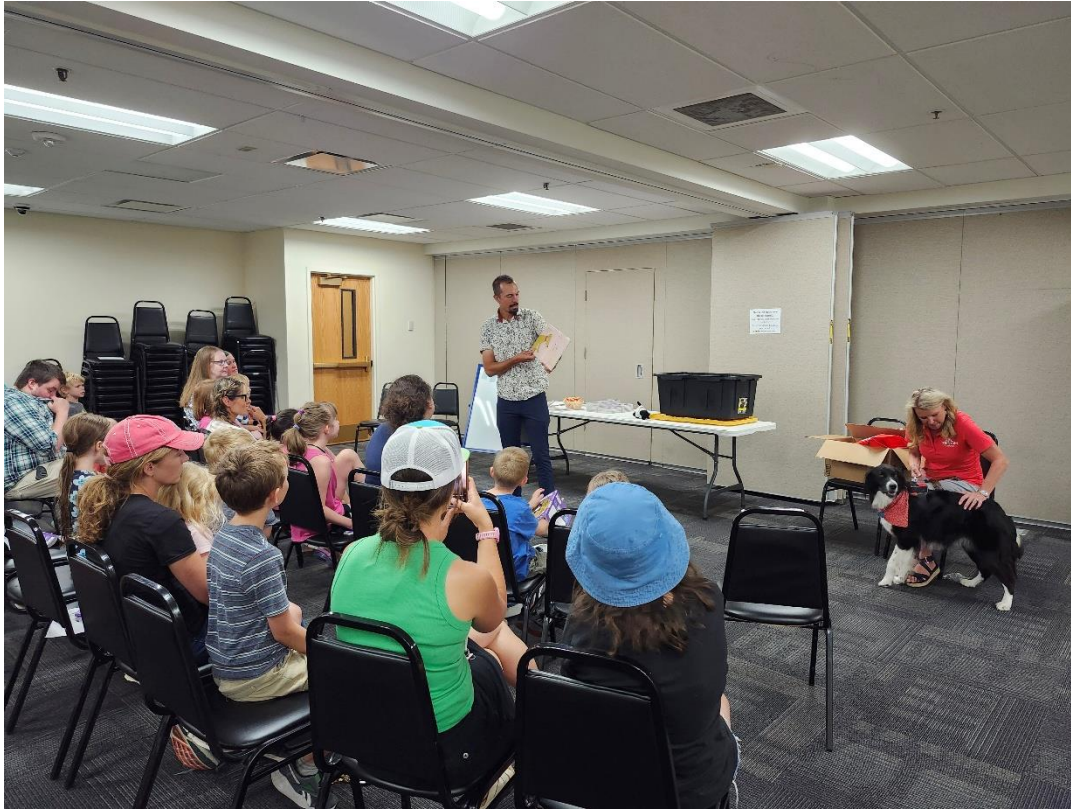
Figure 7 / July 8, 2025 - Paws & Pages