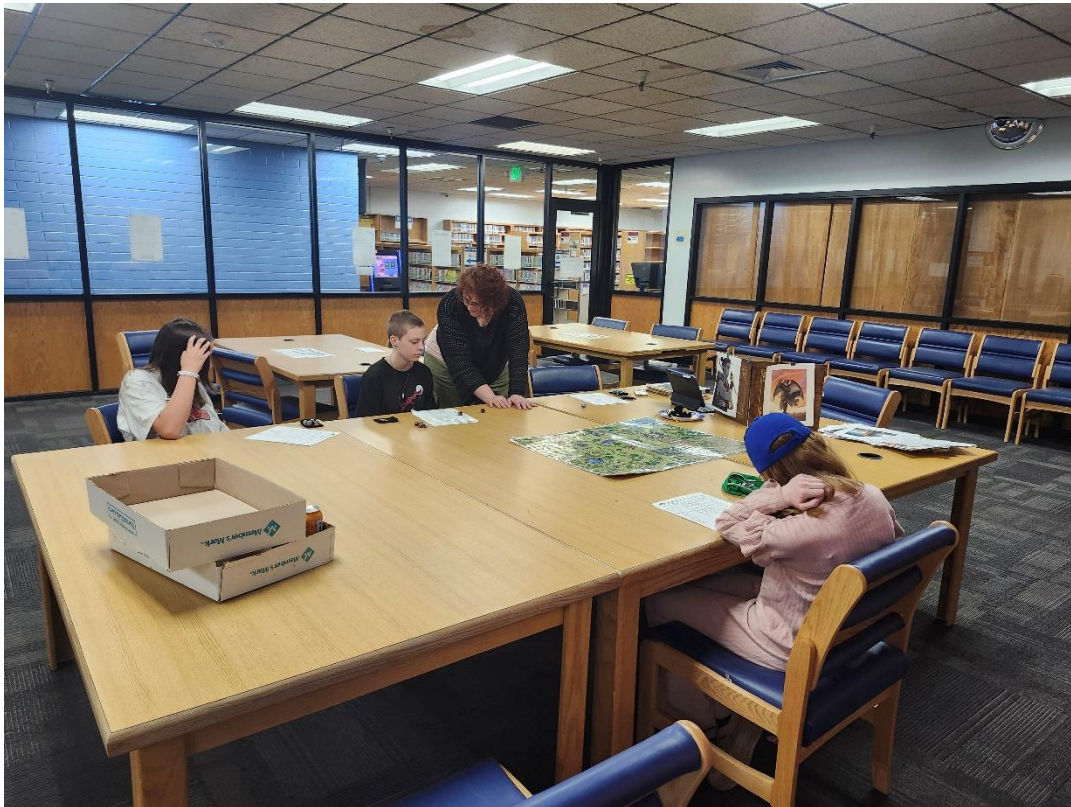
Figure 4 / June 11, 2025 - LybraryWyrms