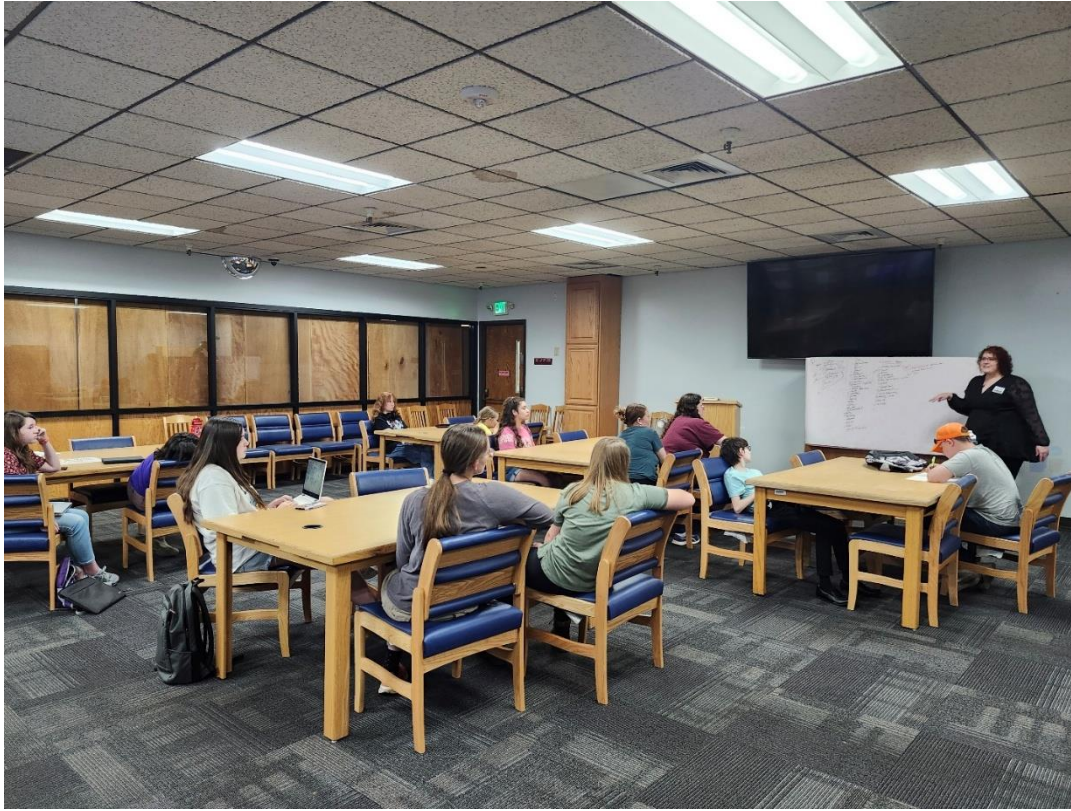
Figure 1 / Jun 9, 2025 - Teen Summer Writing Camp