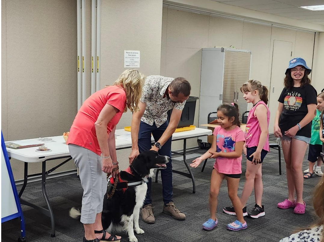
Figure 6 / July 8, 2025 - Paws & Pages