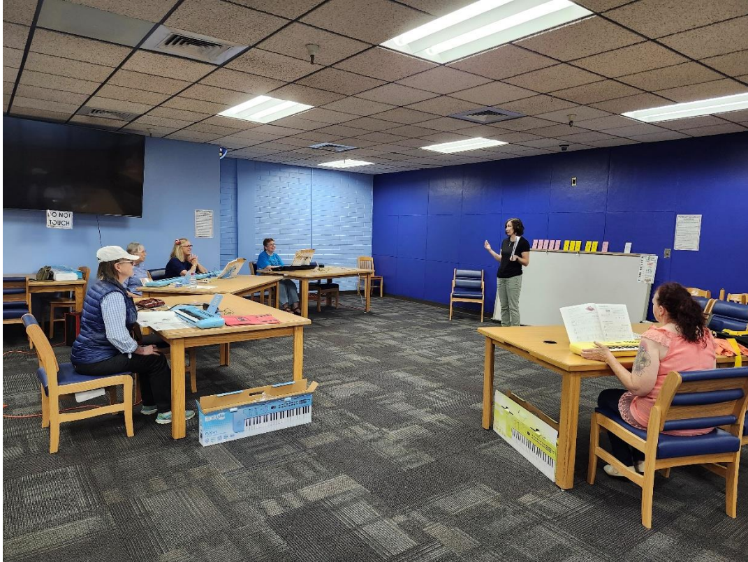
Figure 14 / August 21, 2025 - Never Too Late