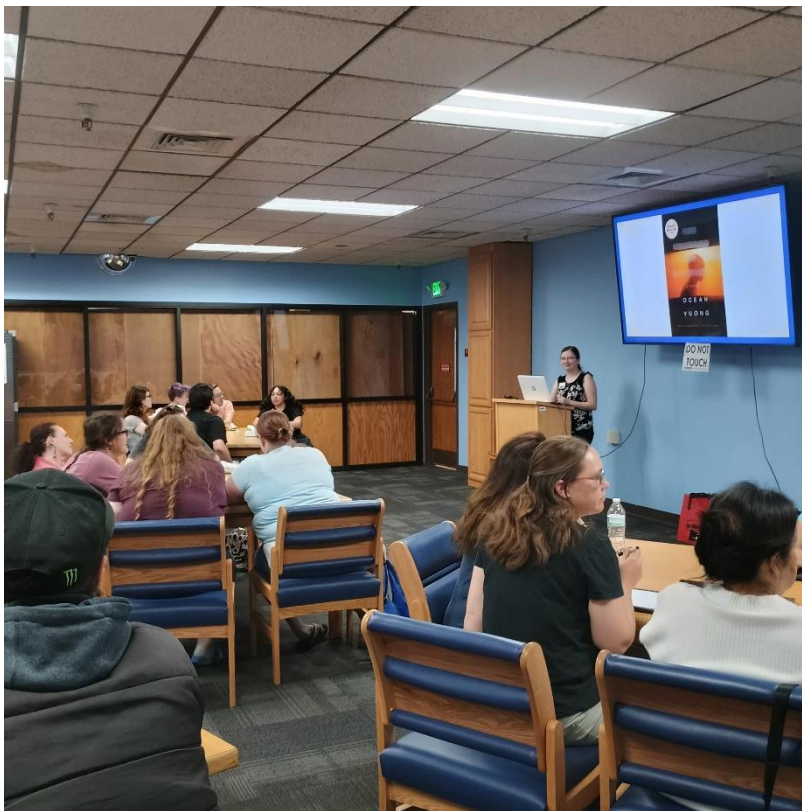
Figure 8 / August 6, 2025 - Library League Trivia