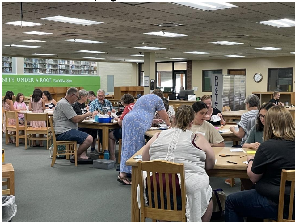
Figure 1 / Book-Making Class, July 26, 2023