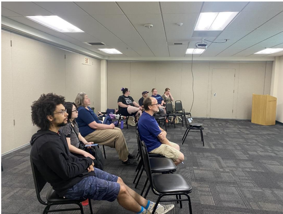
Figure 5 / Money Matters, August 9, 2023