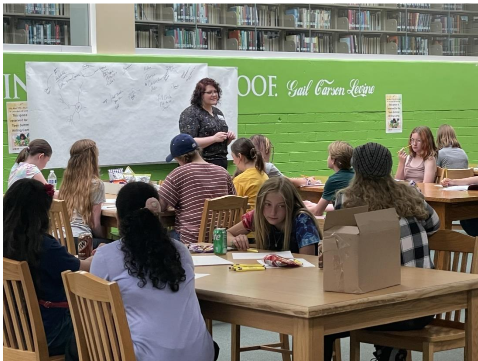
Figure 3 / Teen Summer Writing Camp, July 19, 2023