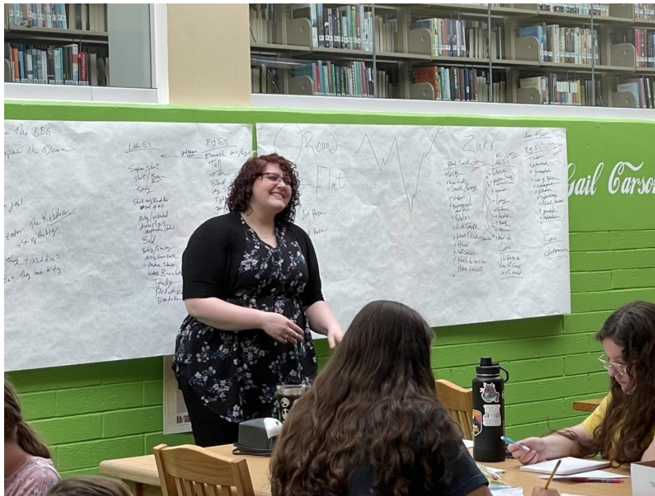
Figure 2 / Teen Summer Writing Camp, July 17, 2023