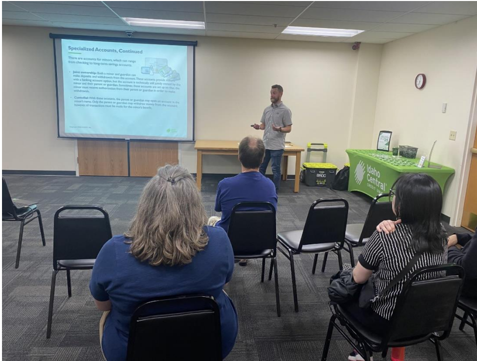
Figure 4 / Money Matters, August 9, 2023