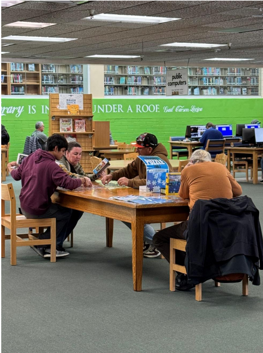
Figure 1 / Patrons enjoying IFPL's new community puzzle table, February 20, 2026