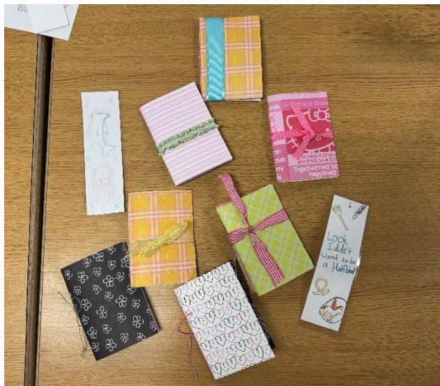
Figure 2 / Teen INC - journals, February 13, 2026