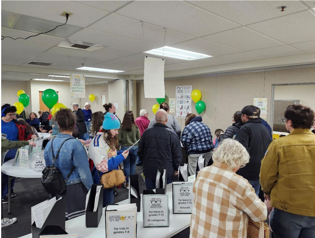
Figure 2 / Extreme Book Nerd Kick-Off, January 5, 2026