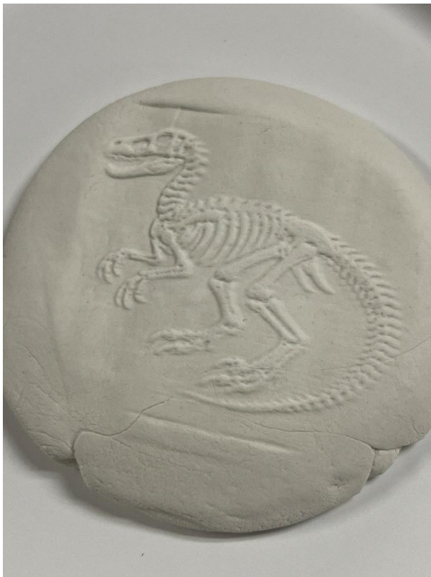
Figure 7 / Teen Inc - Clay Fossils, December 26, 2025