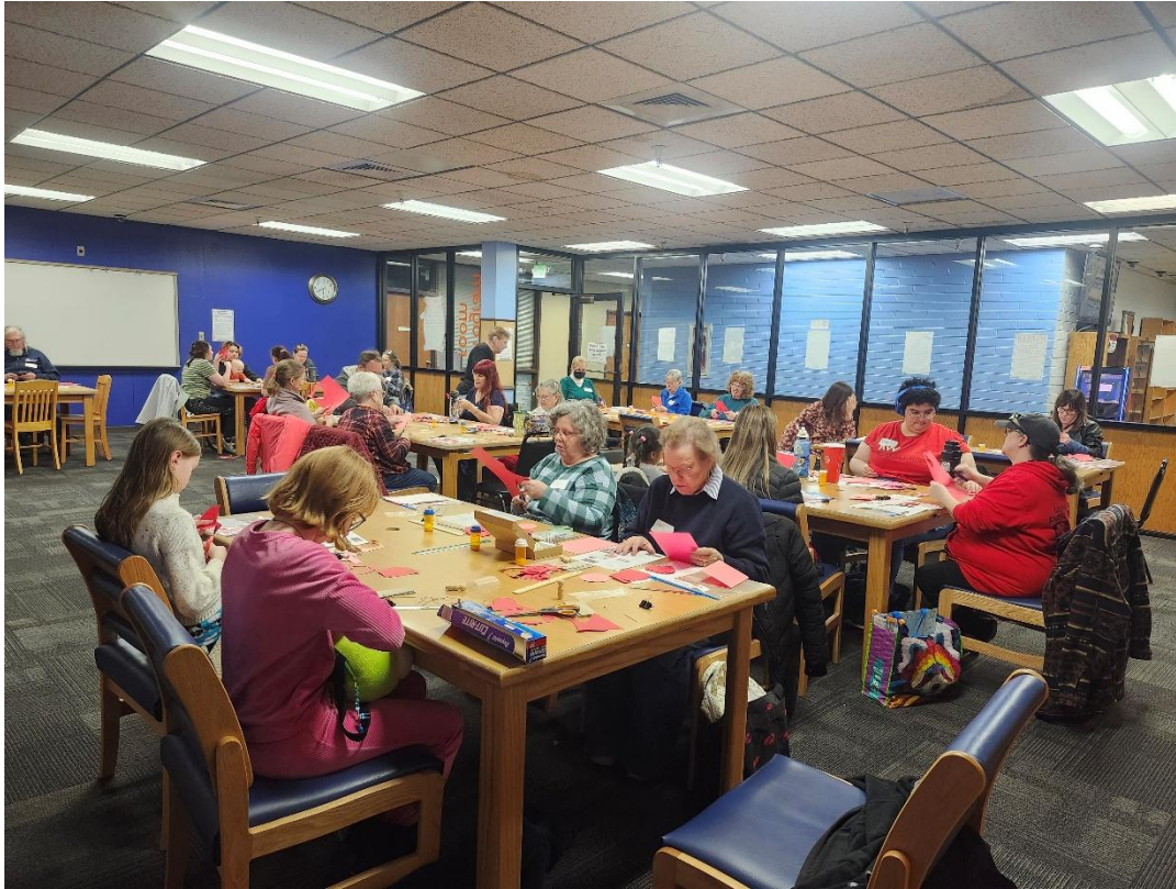
Figure 4 / Paper Arts, January 21, 2026