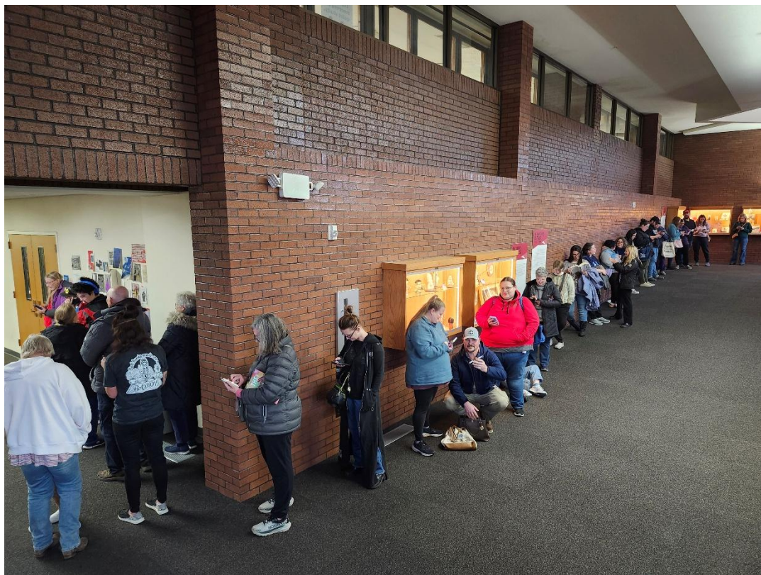
Figure 1 / Extreme Book Nerd Kick-Off, January 5, 2026