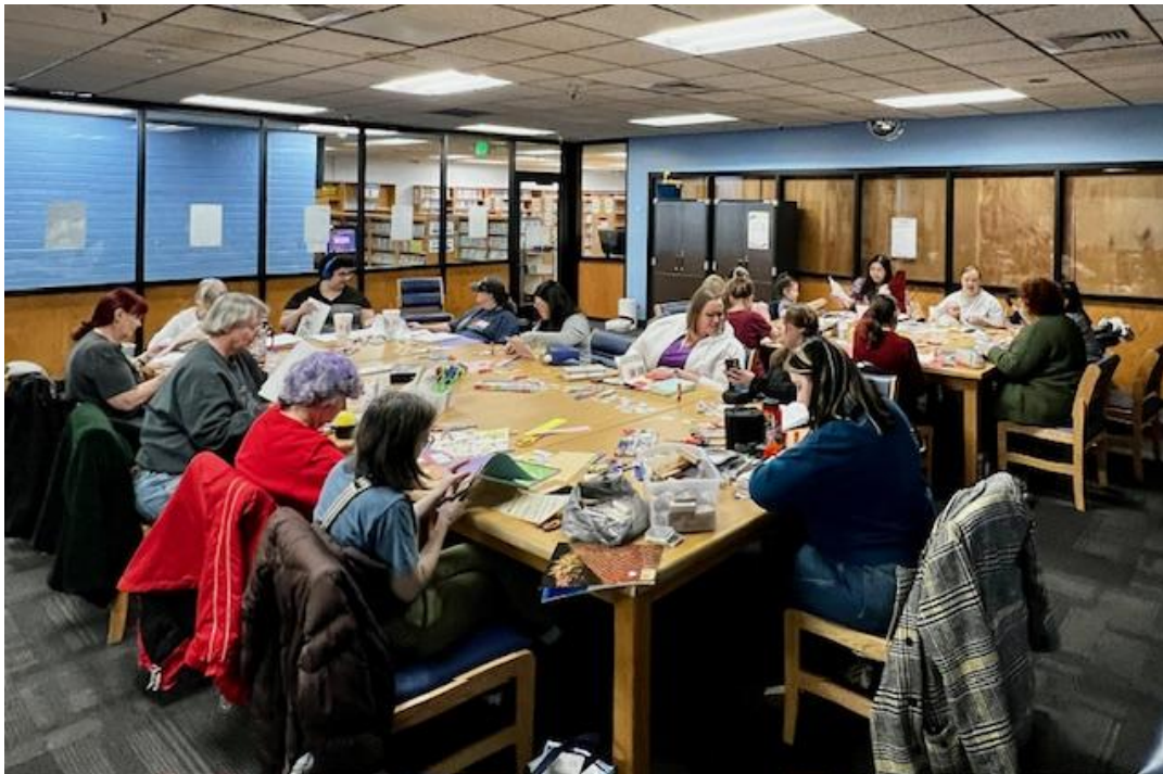
Figure 3 / Journal Jam, January 14, 2026