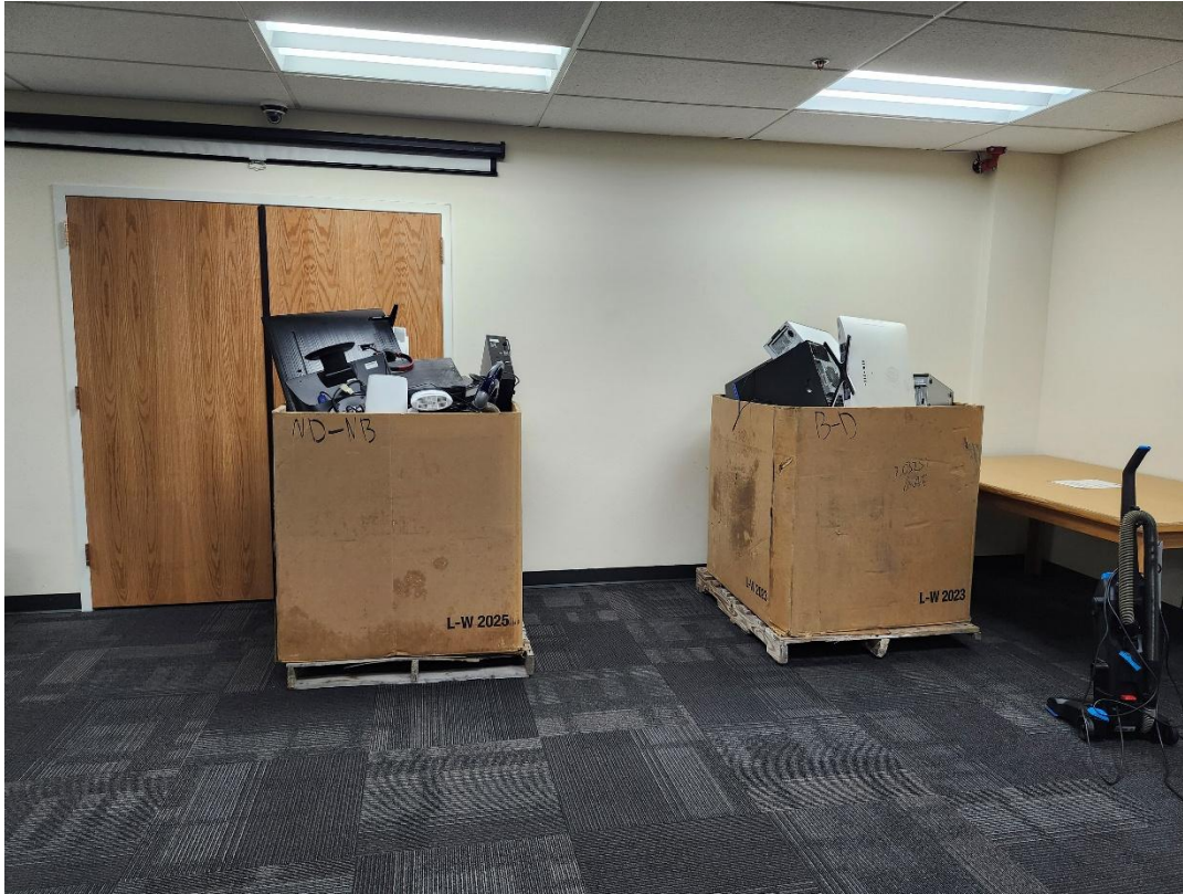
Figure 6 / Recycle Your eWaste, January 24, 2026