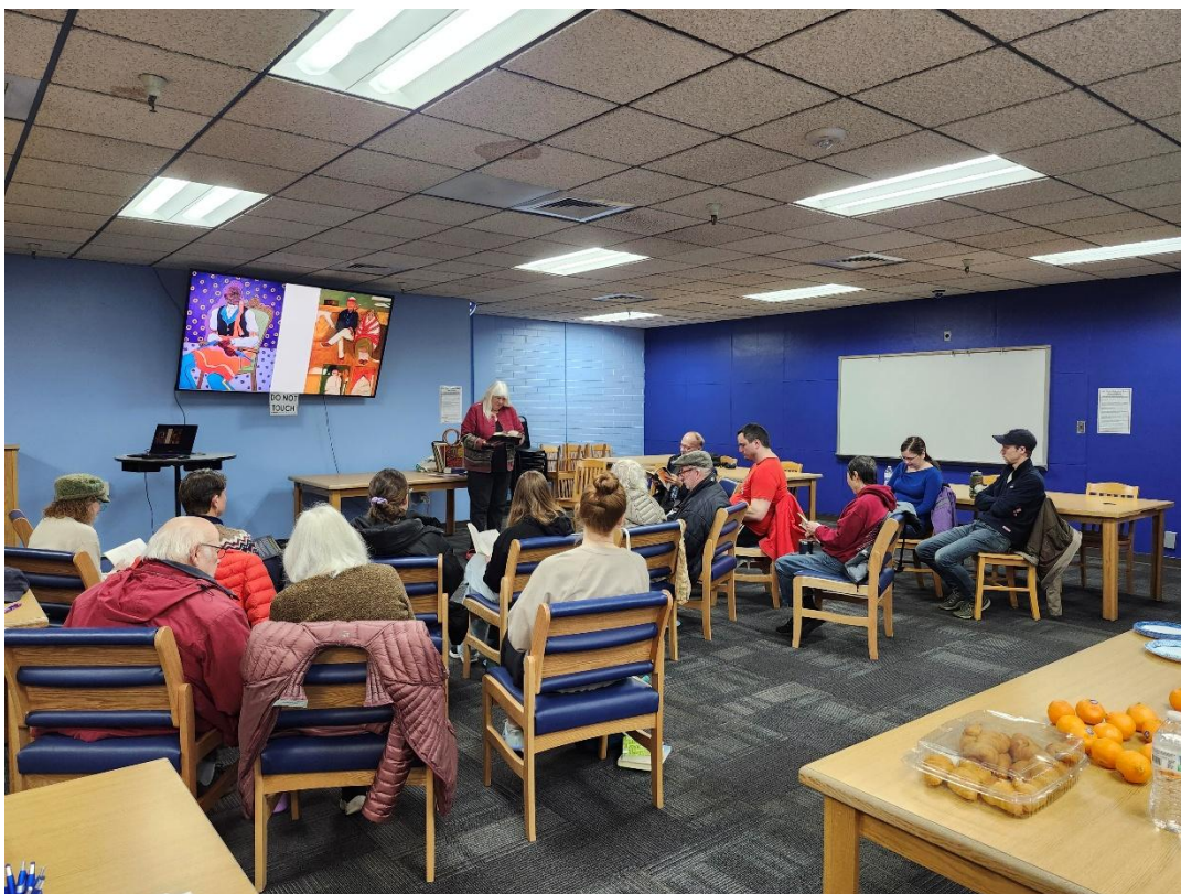
Figure 5 / Let's Talk About It, January 24, 2026